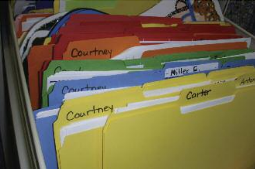
Figure 1. Student Portfolios

philosophy, or belief in a particular pedagogical method but an “approach to planning” (p. 8). Paralleling the principles in UbD, the Massachusetts Department of Education conducted a case study addressing teachers’ approaches to planning instruction for students with significant cognitive disabilities. The study concluded that teachers of students with disabilities must first know the purpose and direction of a standard for all students as well as the educational outcomes expected once students master these goals. The final education outcome for students with disabilities is to achieve or to perform as close as possible to grade level standards as students without disabilities.